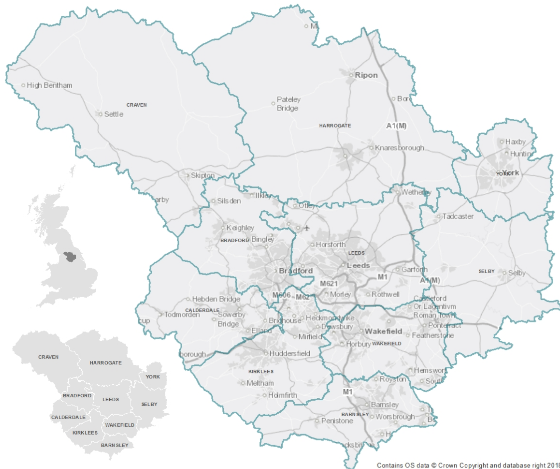
Figure 1 – Leeds City Region Statement of Common Ground Administrative Areas